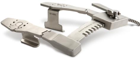
Retractor with Minimally Invasive Blades