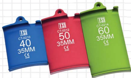
CT-0210 through CT-0214 Atrial Lift Blades • 35mm width • Lengths available in 10mm increments from 40-60mm