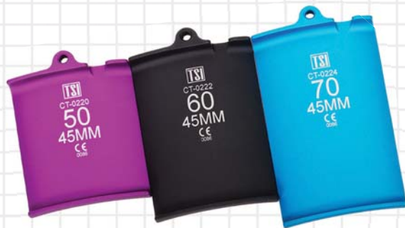
CT-0220 through CT-0224 Atrial Lift Blades • 45mm width • Lengths available in 10mm increments from 50-70mm