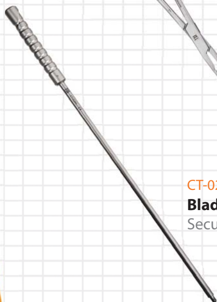
CT-0240 Blade Holder with 5mm Shaft Secures lift blade via intercostal puncture