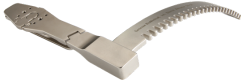
Unique Curved Rack Design